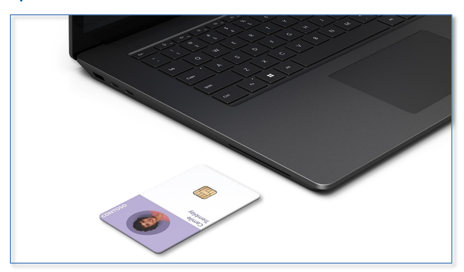
Figure 2. Smart card reader on Surface Laptop 6 15" model