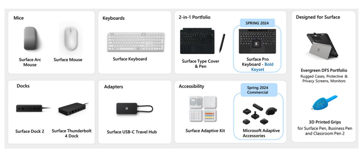
Figure 4. Surface accessories