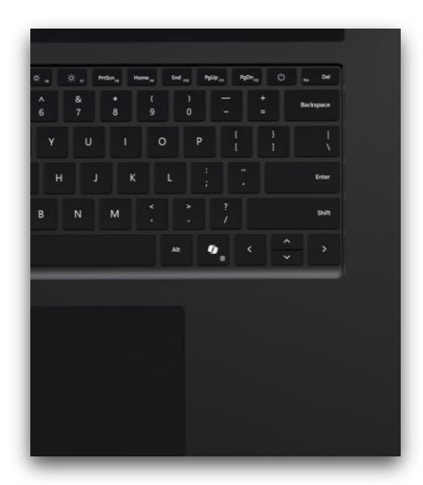
Figure 1. Copilot key on Surface Laptop 6.