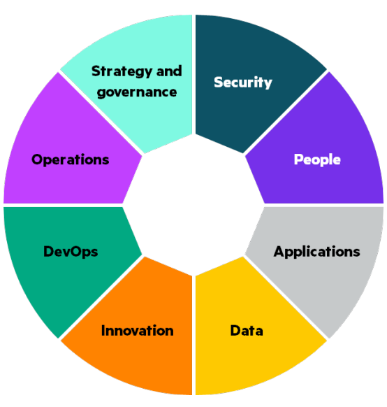
Figure 1. The eight domains of the HPE Edge-to-Cloud Adoption Framework